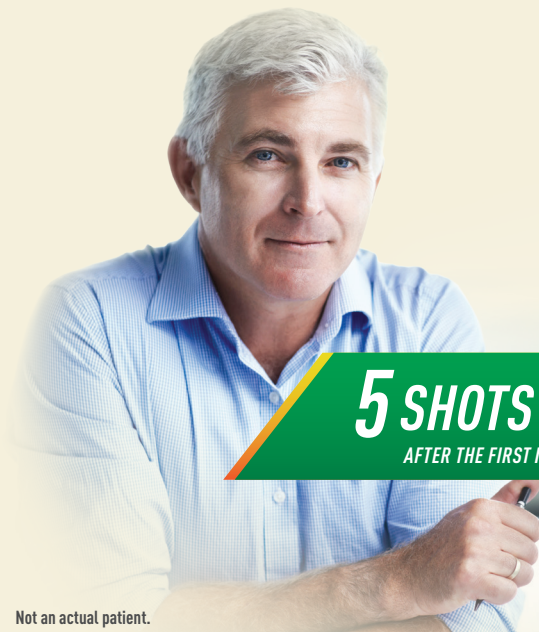
Not an actual patient.

5 SHOTS A YEAR AFTER THE FIRST MONTH OF THERAPY